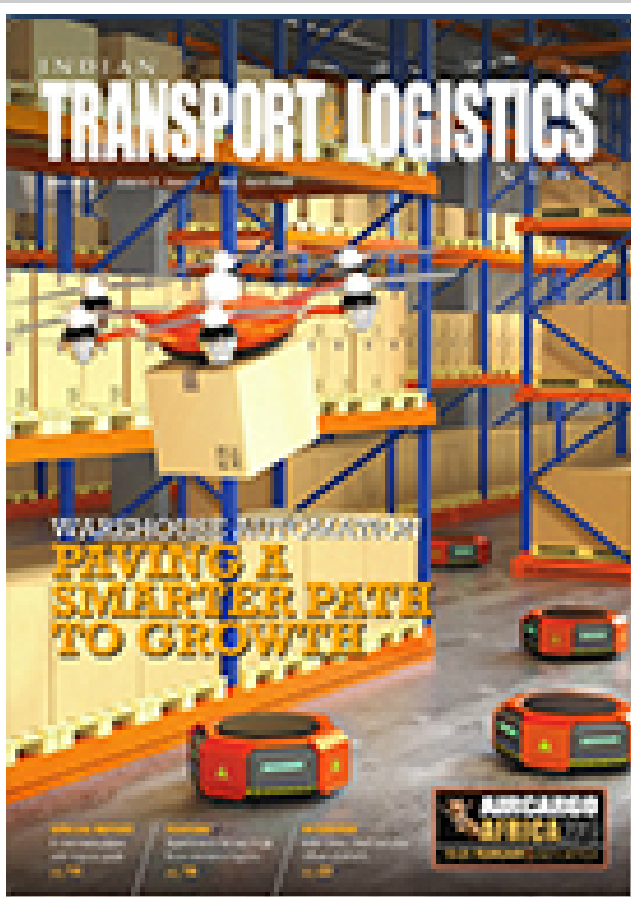
( https://www.magzter.com/IN/STAT-Media-Group/Indian-Transport-&-Logistics-News/News/279808 )