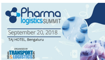
( http://www.itln.in/pharmalogisticssummit2018 )